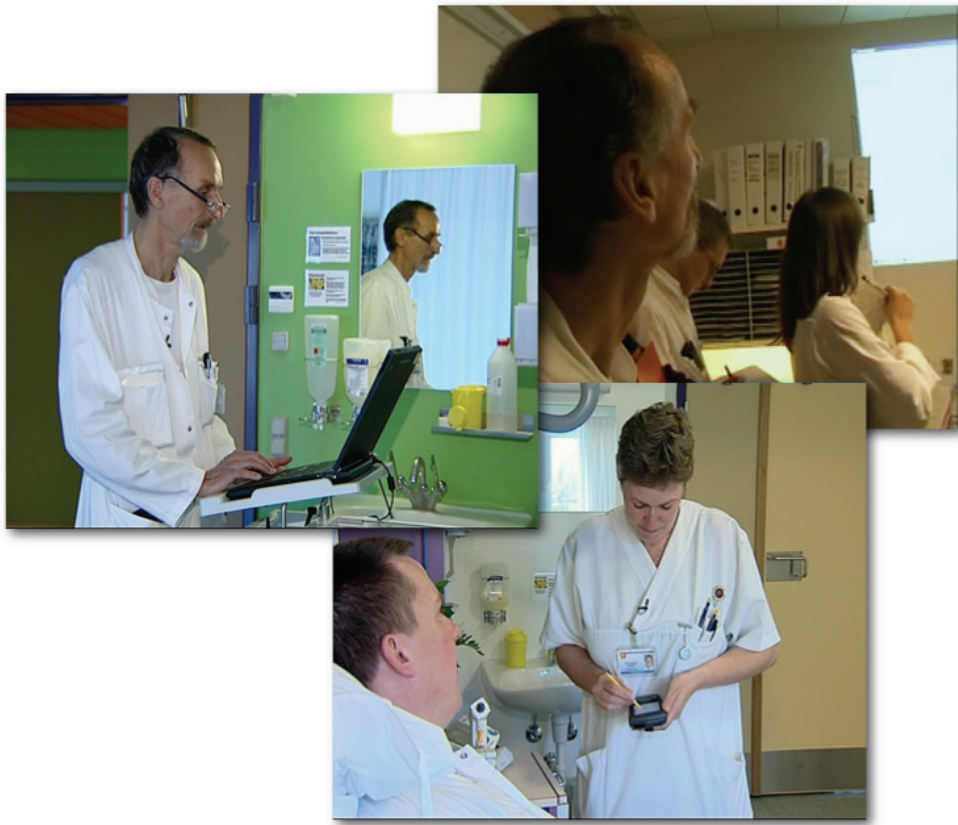
Figure 3: Photos from the five-day period of real use.