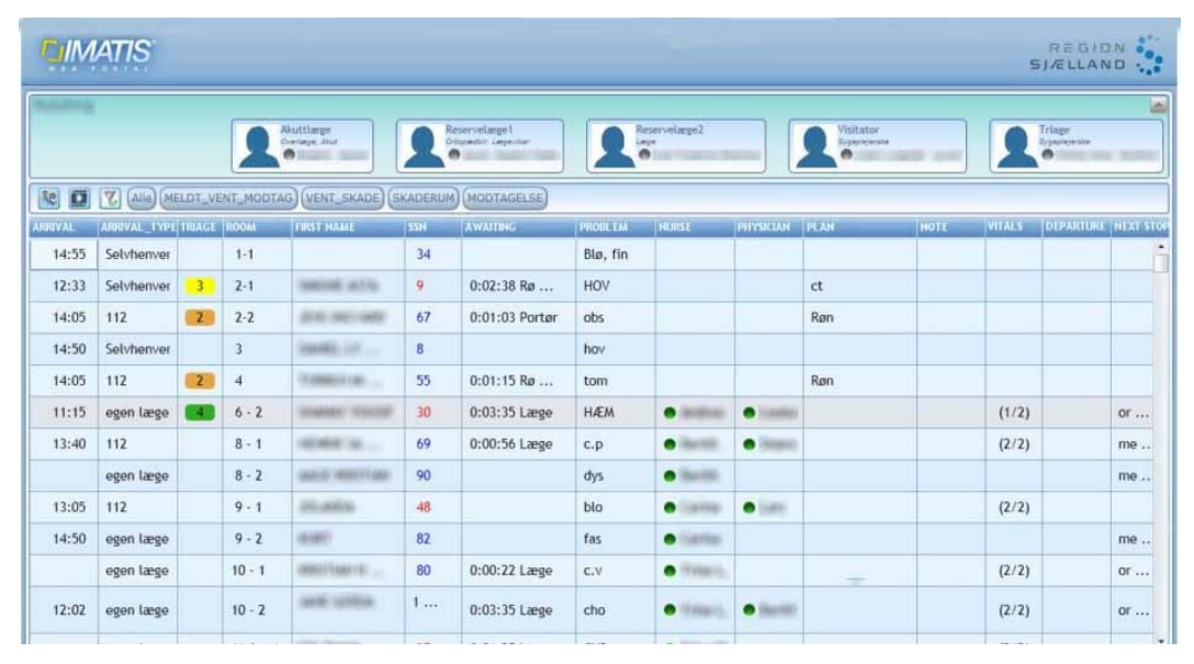
Figure 1: The electronic whiteboard.

current treatment activity (see Figure 1). The clinicians can interact with the system by tapping the wall-mounted touchscreens and by mouse and keyboard. A study conducted before the whiteboard was extended with blood-test icons showed that it was an important coordinative artifact in the ED [16].