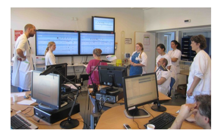
Figure 2: Timeout in front of the whiteboard.

pret test results and for senior physicians to provide advice on additional possibilities to consider. We also observed how the chief physician delegated relevant tasks to the junior physicians, and the more experienced physicians offered them advice on how to perform these tasks.